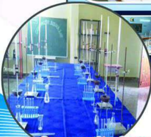
Composite Science Lab