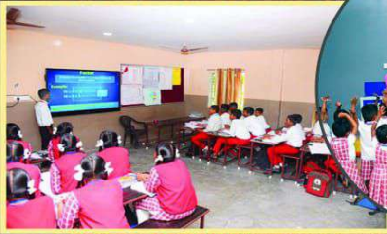
Interactive Flat Panel