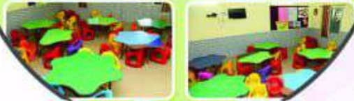
Class Rooms (KG)